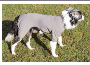
Dog-suit sleeves front & back, covers hips. Good for contact allergies or connecting front & rear